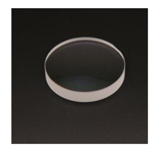
25 - 45 €

Lens cover to protect the lens and the laser source. Ask for your diameter. (Illustration)